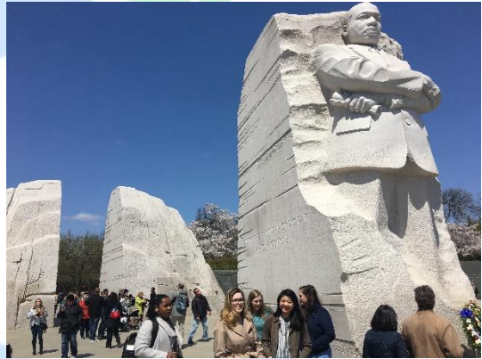
“Out of the mountain of despair a stone of hope”